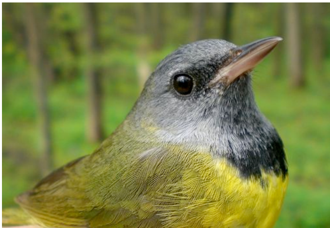
(Blackpoll Warbler & Mourning Warbler photos by Sumiko Onishi)

Full details of the spring coverage season will be included in our 2011 final report. We return to the field on August 1 st to start our Fall migration coverage and welcome you to come and visit us at Fish Point!